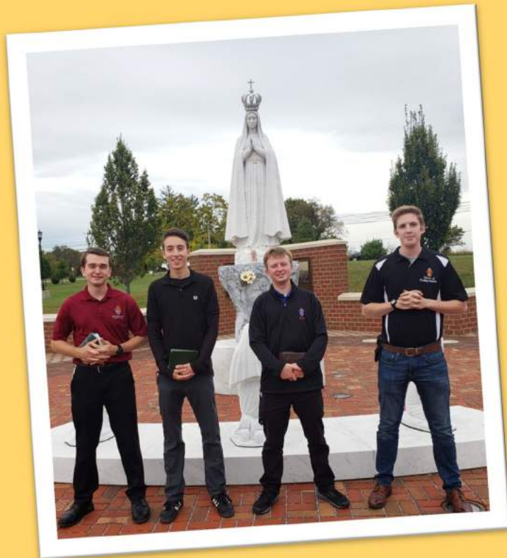
Seminarians from the Saint John Paul II Seminary in Washington, D.C. visited us and our Blessed Mother on Saturday, October 4